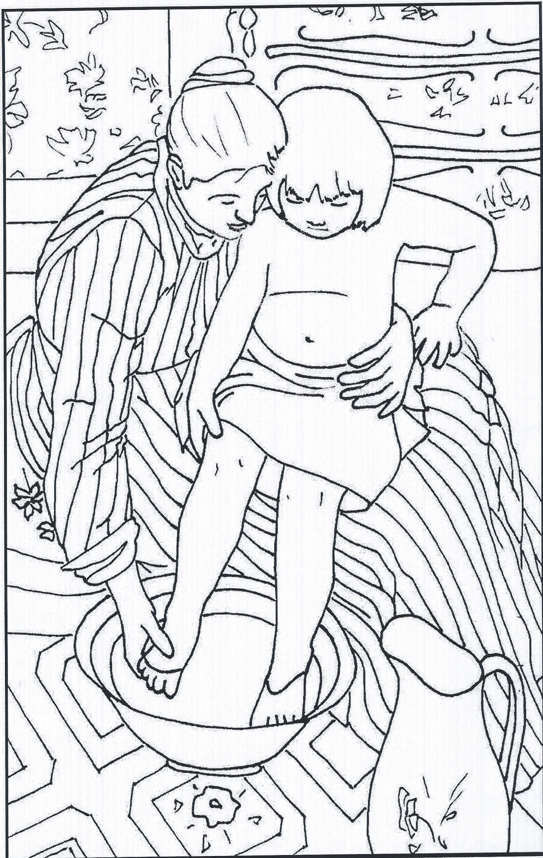
012. Drawn from Cassatt, Mary. The Child's Bath . 1893. The Art Institute of Chicago.