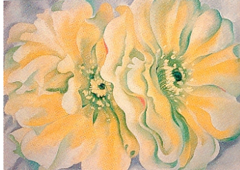
Yellow Cactus Flower