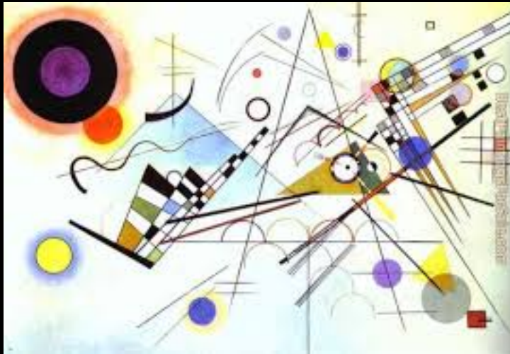
Composition VIII, 1923