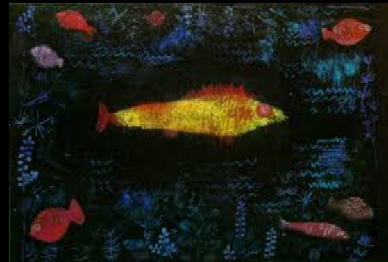
Der Goldfisch, 1925