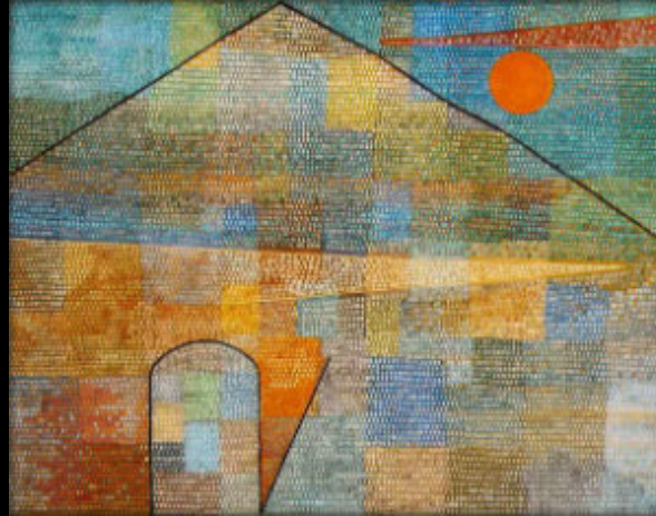
Ad Parnassum, 1932