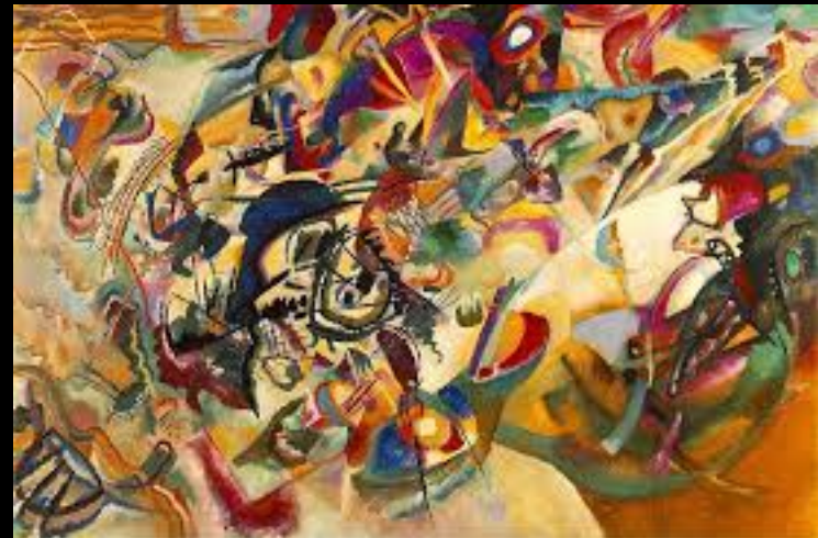
Composition VII, 1913