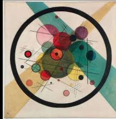
Circles in a Circle, 1923