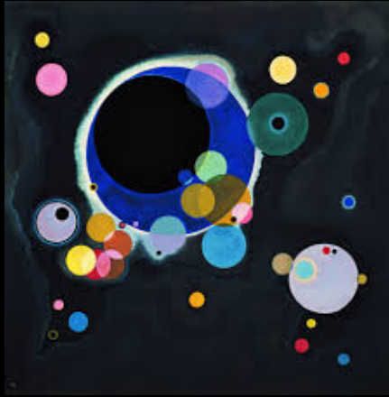
Several Circles, 1926