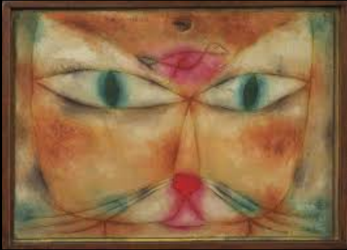
Cat and Bird, 1928