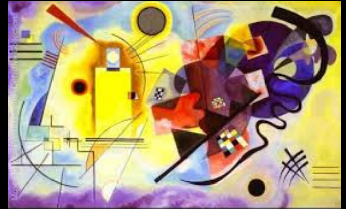
Yellow, Red, Blue 1925