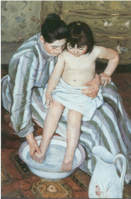
"The Bath" by Mary Cassatt