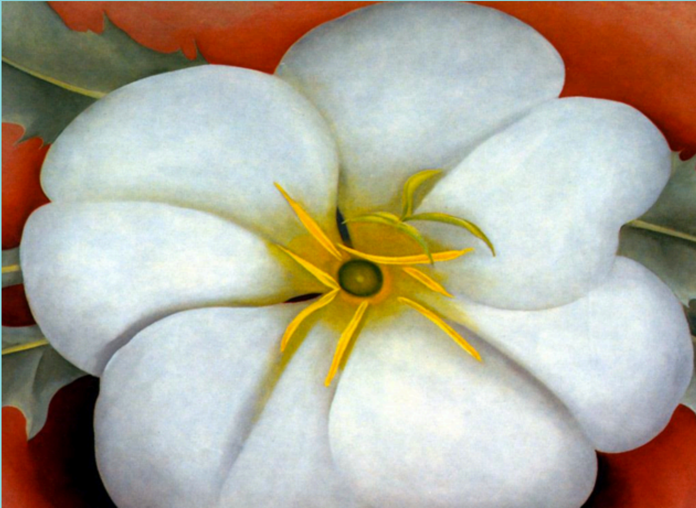
White Flower on Red Earth