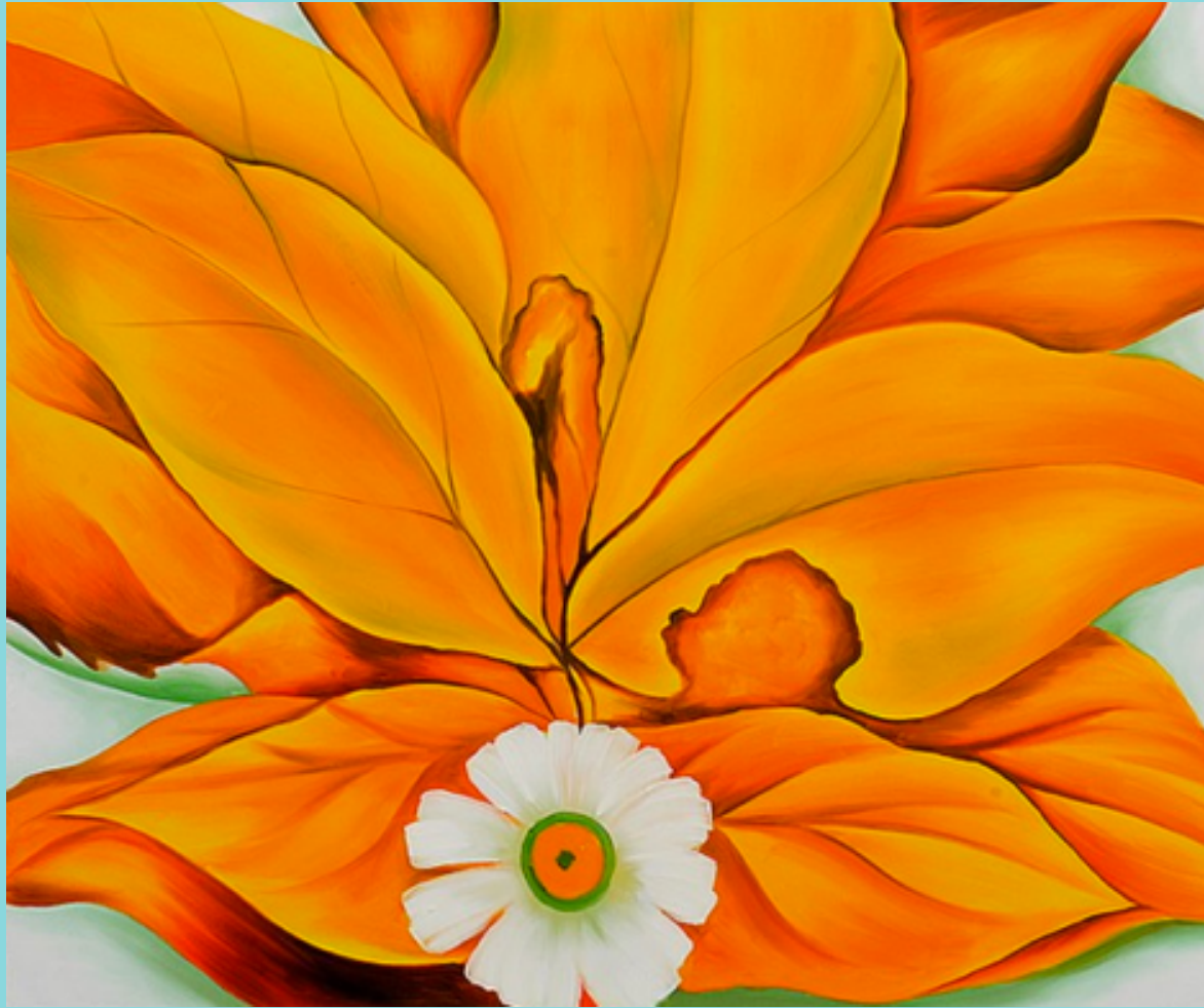
Yellow Hickory Leaves with Daisy